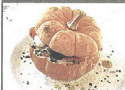
Lobster in mini-pumpkin