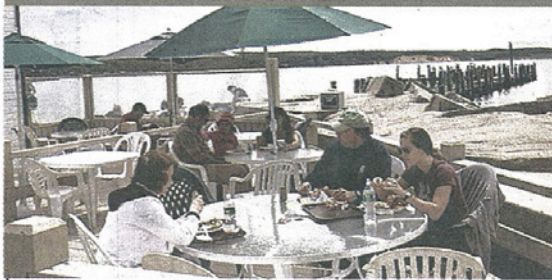
A great duo at Duryea's: lobster and a view of Fort Pond Bay