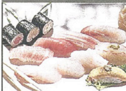
Consistently good raw fish