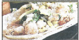
Shrimp tacos by the pond