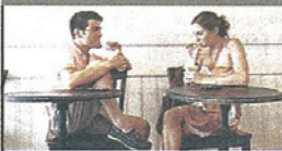
Ice cream and shakes, too