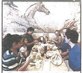
Fine dining (no turtles)