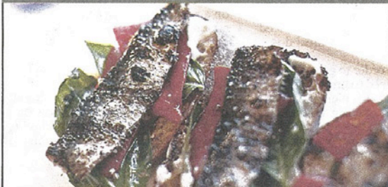
Grilled sardines are a standout "small plate" at Noah's.